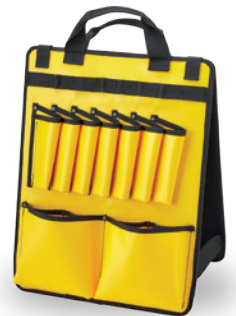
B321 Pallet included with B320 Backpack